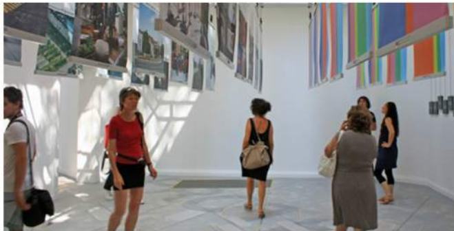
(click on image to enlarge)

Chicago Cultural Center > Visual Art Program > Exhibitions > Past Exhibitions > Spontaneous Interventions